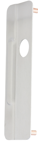
RH (LHR) shown